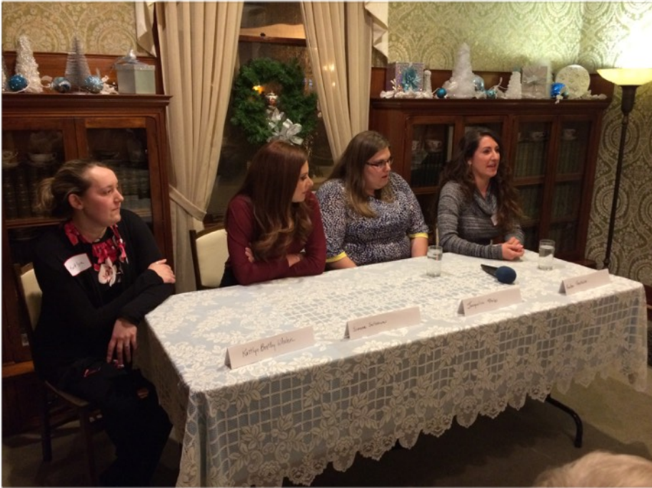
The four panelists at the program meeting talking about their experiences.